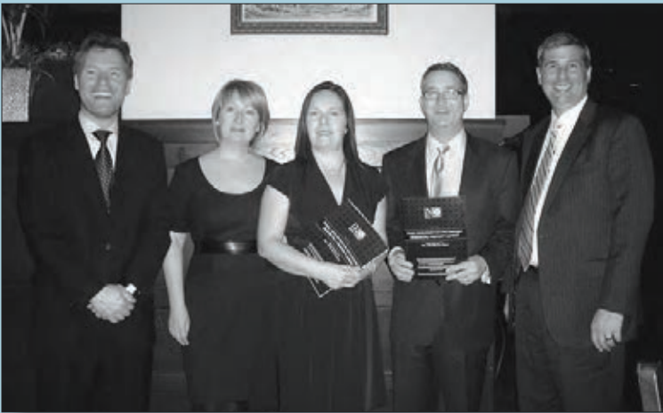
Panel Discussion on Real Estate. April, 2011.