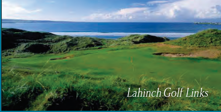
Lahinch Golf Links