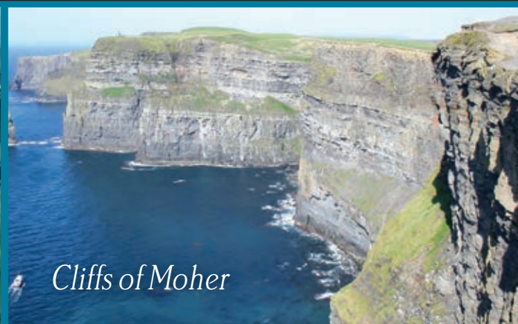
Cliffs of Moher