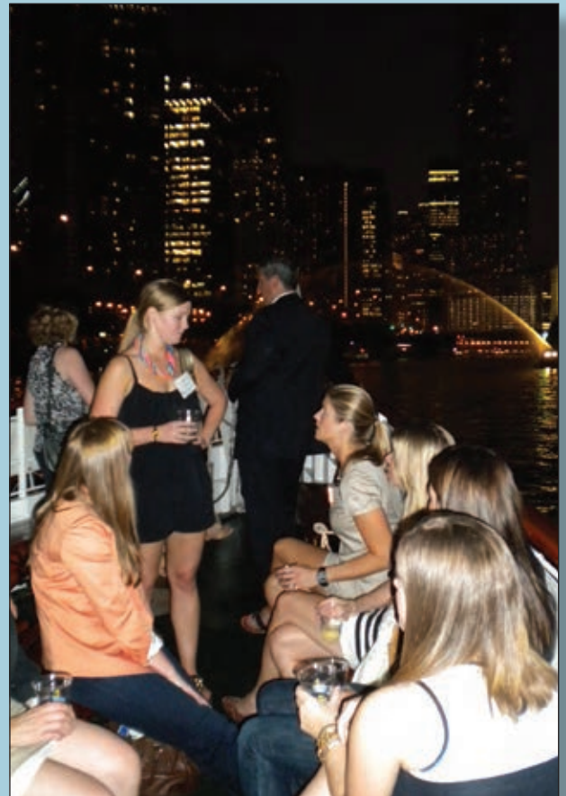
Annual Lake Michigan Boat Cruise with AIF Young Leaders. August 2011.