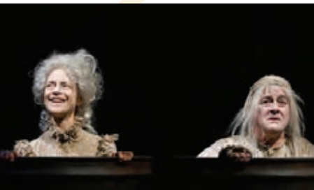
Endgame at Steppenwolf.

“Oh,” said my friend. “You just haven’t seen how it’s done in Chicago. Chicago is truly at home with Irish theatre.” How right she was.