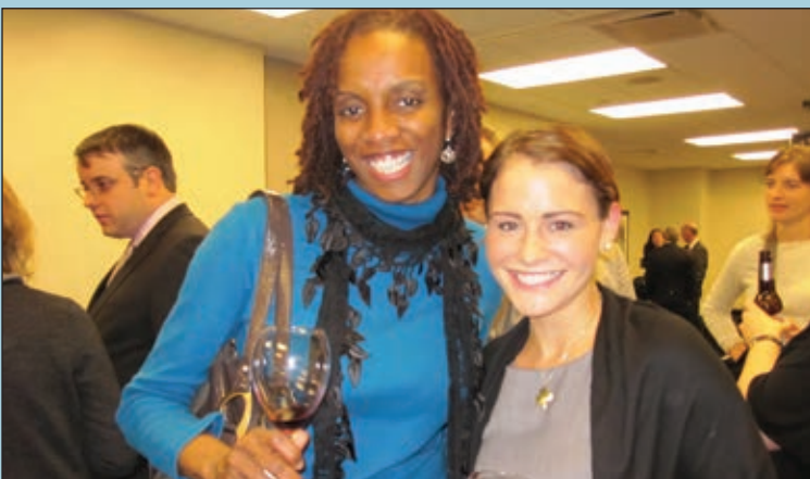
Networking over a nice cabernet.